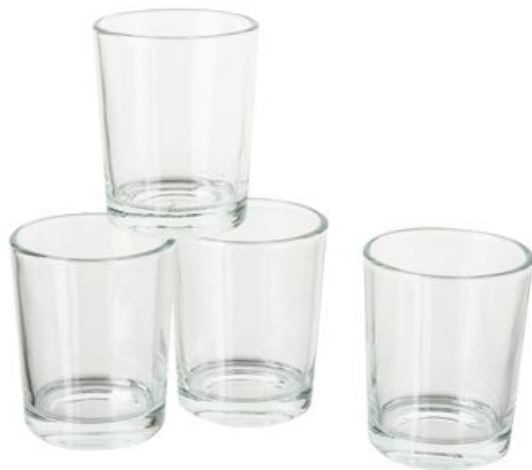
VBS Tea light jars "High"