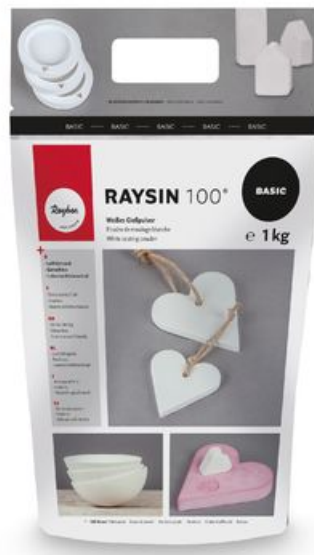
Casting powder "Raysin 100", white, 1 kg